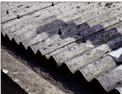
AC sheets used as roofing